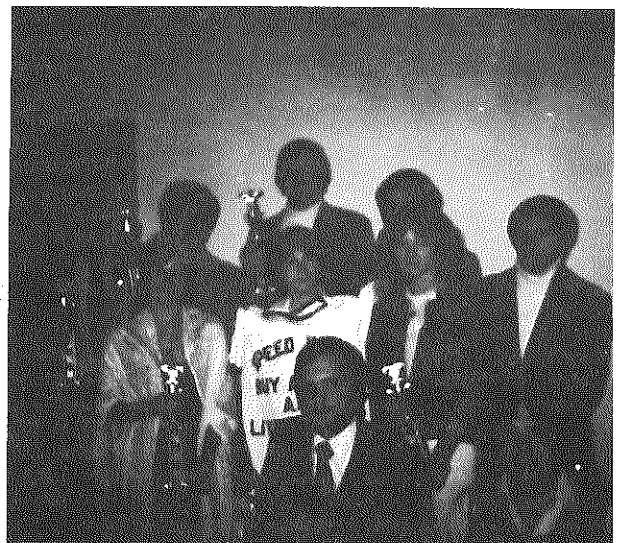
SOLO II CLASS WINNERS